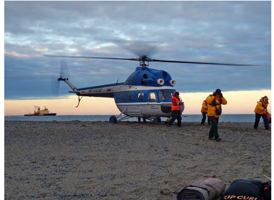
The most effective combination to reach extremes: A helicopter and an icebreaker

Result: We present an important result because it is based on all lists in existence (Apr 20, 2018): One list of 44 travelers, the "Extreme travelers" - high performance travelers, a hybrid performance of quantity and quality.