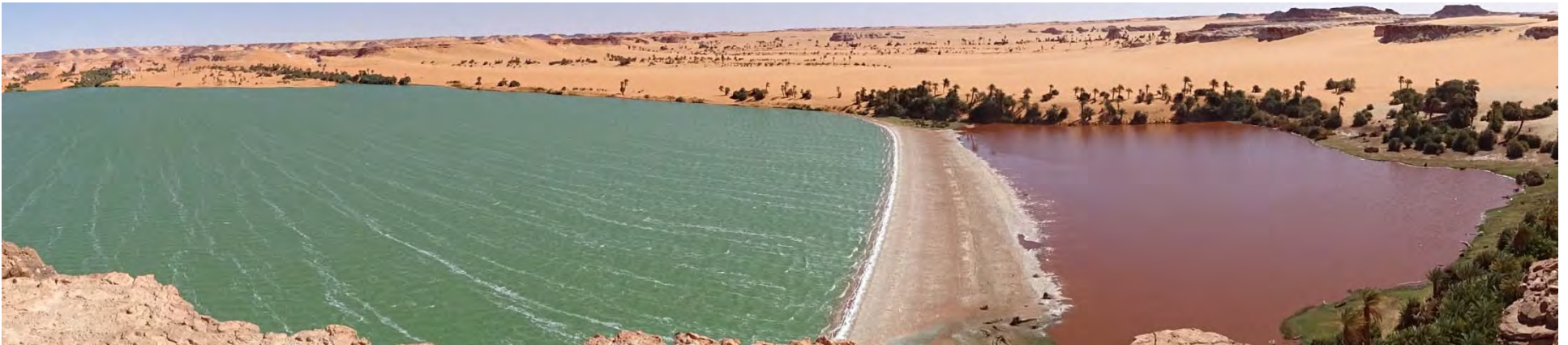
Lake Ounianga, Chad

Two new ideas: Not only ranks per list, but ranks per traveler Measuring the breadth of the travel spectrum