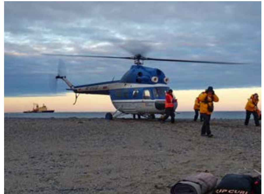
The most effective combination to reach extremes: A helicopter and an icebreaker

Result: We present an important result because it is based on all lists in existence (Nov 17): One list of 39 travelers, the "Extreme travelers" - high performance travelers, a hybrid performance of quantity and quality.