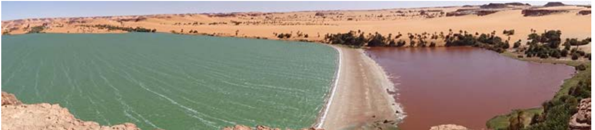
Lake Ounianga, Chad

Two new ideas: Not only ranks per list, but ranks per traveler Measuring the breadth of the travel spectrum